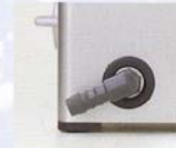
Positioned drain duct