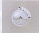
Knob for drain on side

The Elmasonic S units are available in 13 different sizes, ranging from 0.5 liter (approx. 0.1 gal or 0.5 quart) up to 90 liter (approx. 24 gal). They are equipped with efficient 37 kHz ultrasonic high-performance transducers of the latest generation.