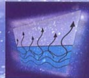
Degas and Autodegas

The Elma S ultrasonic units offer practically every available technical feature. Now the units of the new series increase the ultrasonic effect further to obtain even better results.